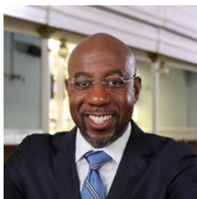
U.S. Sen. Raphael Warnock, D-Ga.