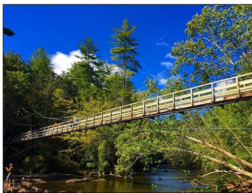
The Swinging Bridge over the Toccoa River