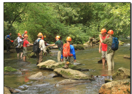
Trail Maintenance on Jacks River Section